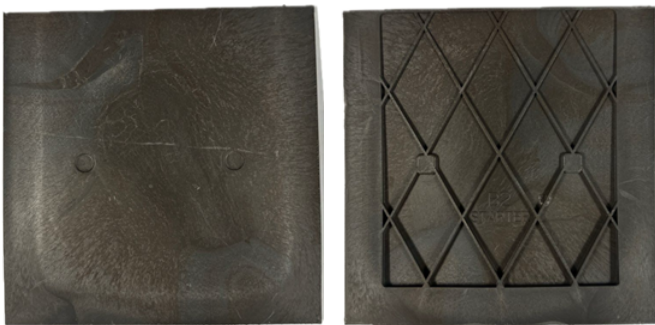
PREVIOUS STARTER – 12" X 12" TEXTURE ON FRONT EDGE/STRUCTURAL RIBBING BACK