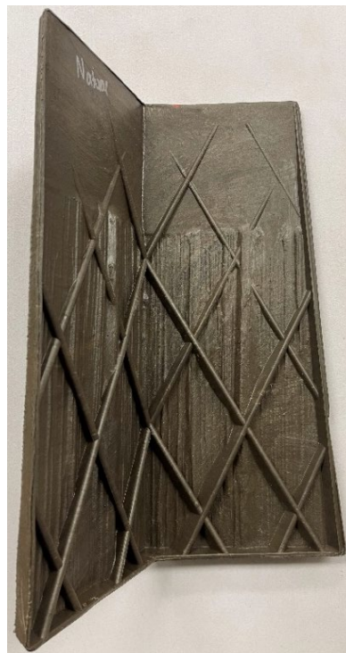
Old Structural Ribbing Back