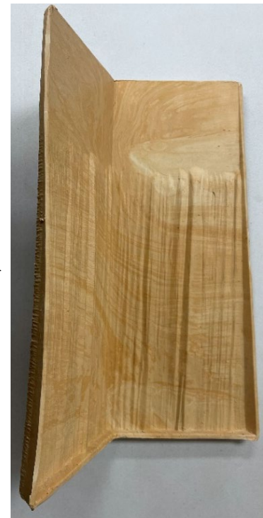
New Textured Back No Structural Ribbing