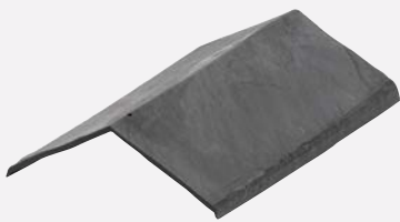
Low (160°) – Steep (90°)

Follow the chart below to determine correct hip and ridge cap for the slope of your project installation.